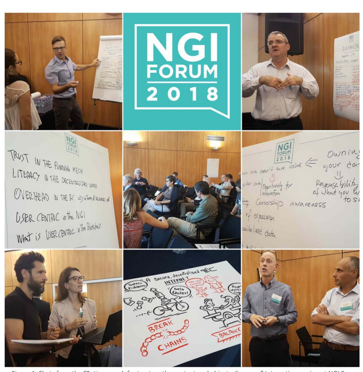
Figure 1: Shots from the "Better search for trustworthy content and objects discovery" interactive session at NGI Forum 2018

A brief report of the third session at NGIForum18: "Better search for trustworthy content and objects discovery" by SpeakNGI.eu. Porto 13th September 2018