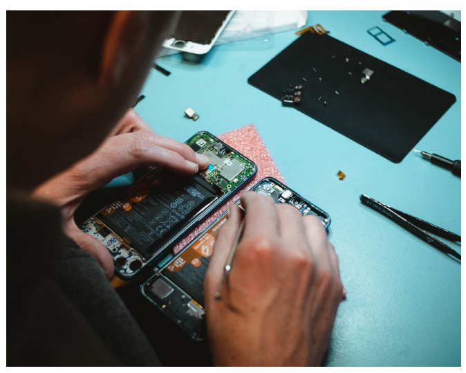
Europe urgently needs a Right to Repair