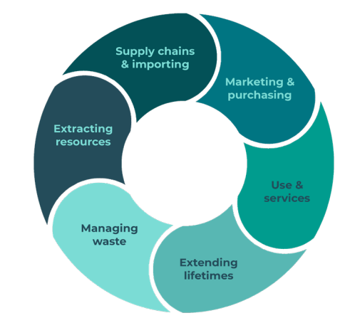
Fig. 2: Steps of the tech lifecycle where intervention should be targeted

The life of any modern internet device starts deep underground, in mining operations extracting metals and rare earth element. Often, these mines are located in countries with lacking environmental and labour regulations. The upcoming Conflict Minerals Regulation seeks to address some of the impacts associated with mining in regions of conflict but leaves room for expan sion and improvement. Technology companies should be required to report on the socio-environmental impacts of materials they source from a broader range of high-risk areas. Policymakers could also explore the possibility of mining some materials within Europe and extracting rare earth metals from recycled de vices .