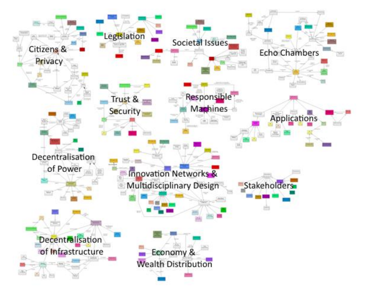
FIGURE 1: DOMAIN MODEL AFTER PARTIAL CLUSTERING

For detailed information on the analysis please refer to the HUB4NGI public deliverable "D2.1 NGI GUIDE V1" [HUB4NGI D2.1].